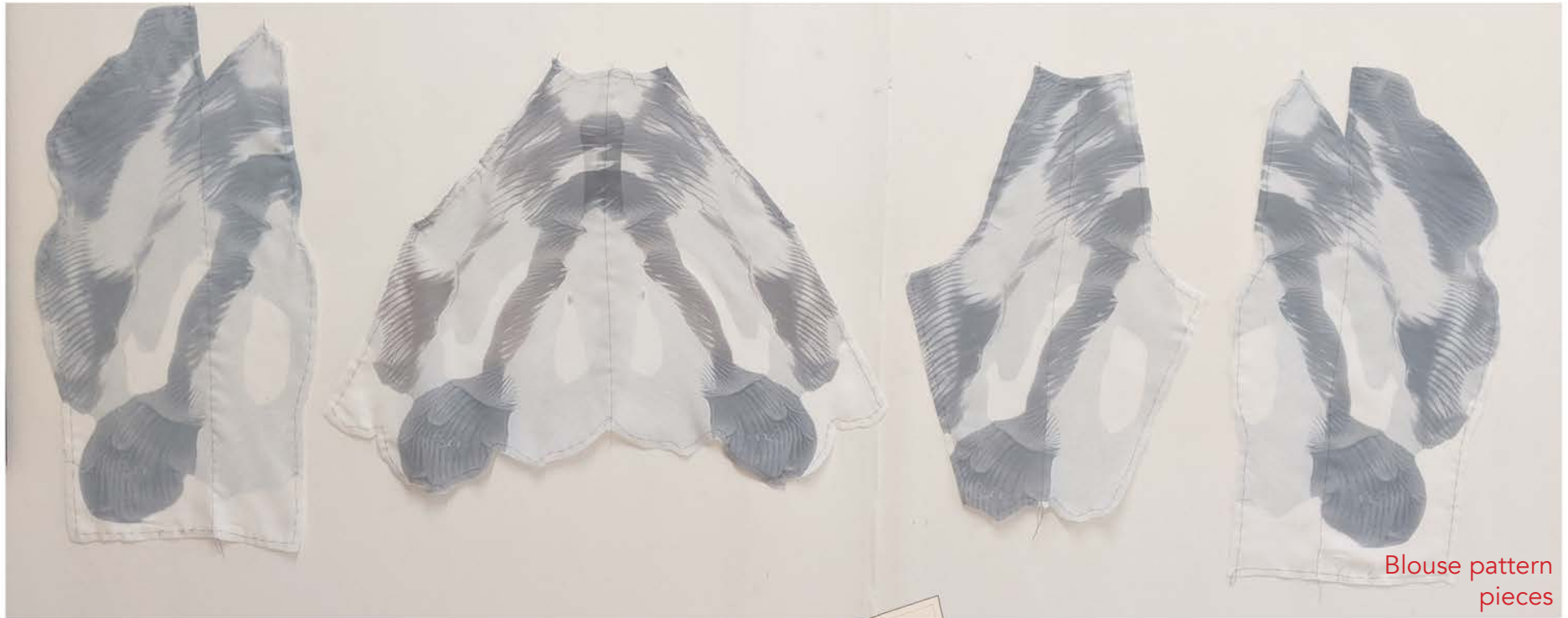
Blouse pattern pieces

I used Gerber to make the pattern pieces digital. I did this so that the print could be re-applied to the pattern pieces since I draped without it. Doing this enabled me to make sure the print was centered to the pattern pieces and fit together perfectly