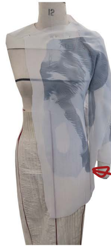
Using heat pressing to print fabric and the print itself as a pattern piece

I wanted garments that are inspired by the Rorschach test to make consumers and anyone who saw the garments to think about what they could see in the print