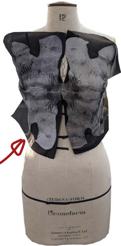
Looking into draping with screen printed fabric