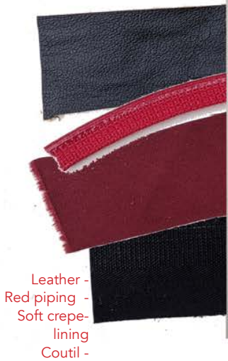
Leather - Red piping - Soft crepe- lining Coutil -